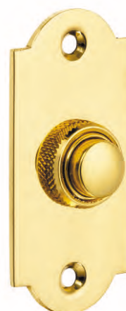
1914 Arched Bell Push