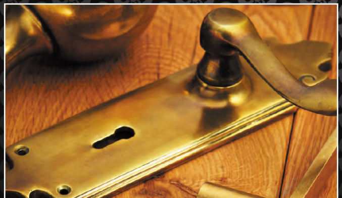
Aged Brass *