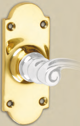
100 x 41mm Arched Latch