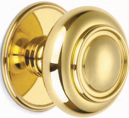
4176 Verve Centre Door Knob