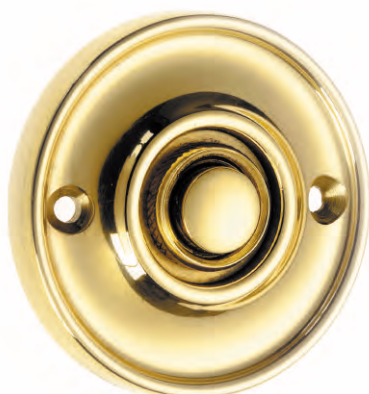
1913 Round Bell Push