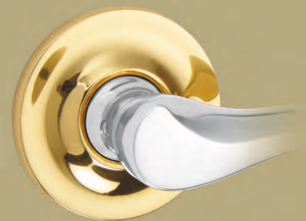
57mm Plain Covered Rose Also available in 65mm