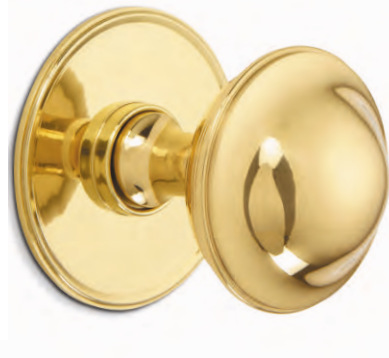
4175 Plain Round Centre Door Knob

Also available in Mortice or Rim Versions. See page 36