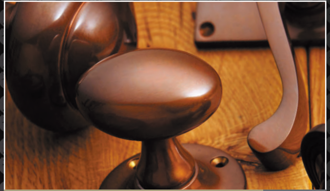
Imitation Bronze Metal Antique * IBMA