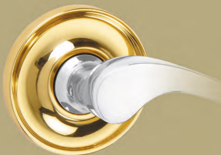
57mm Raised Edge Covered Rose Also available in 65mm

This backplate can be supplied unsprung or with standard springing