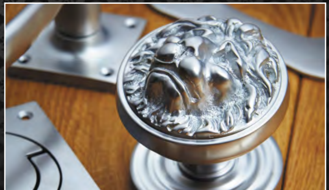
Satin Chrome Plate