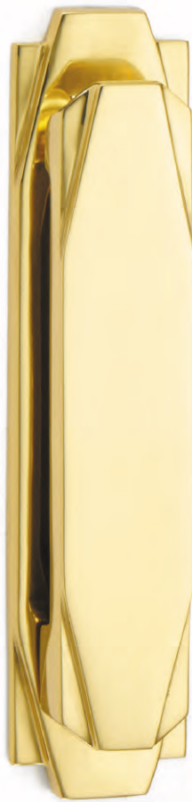
7012 Art Deco Door Knocker