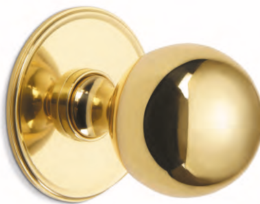
6405 Ball Centre Door Knob with Round Rose