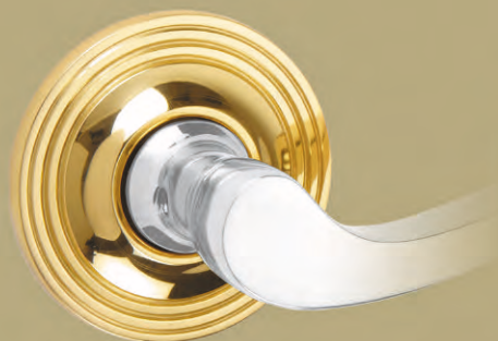
57mm Reeded Covered Rose Also available in 65mm