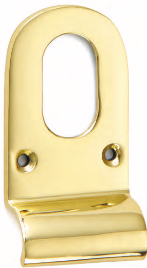
1773 Oval Profile Cylinder Pull