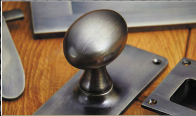
Antique Nickel *