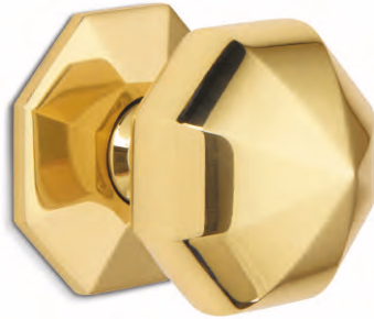
1751C Octagonal Centre Door Knob

“effortlessly smooth contours enhance the appearance of any door”