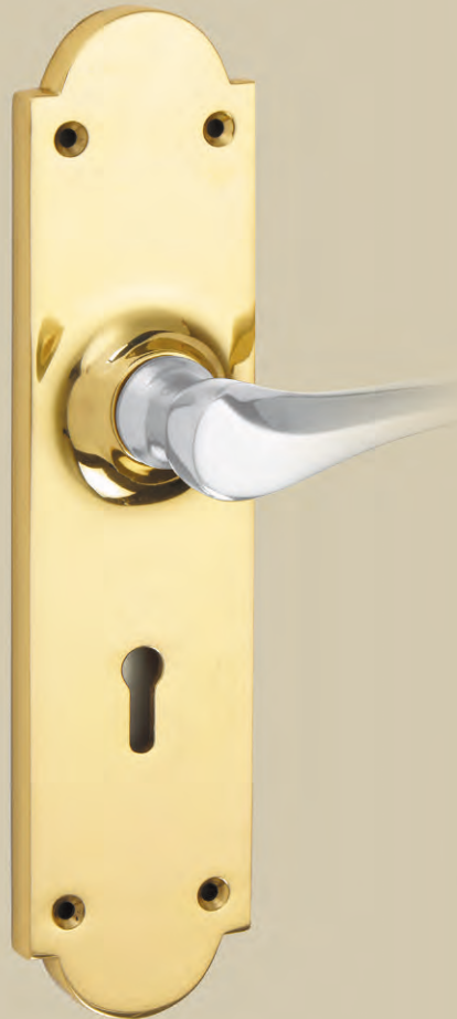
210 x 50mm Arched Lock (shown)