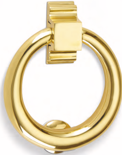
1893 Ring Knocker