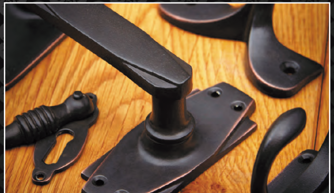
Distressed Oil Rubbed Bronze * DORB