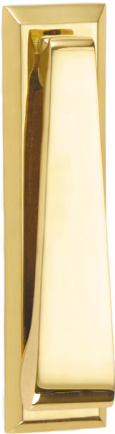
1750 Plain Door Knocker

make an entrance with our range of traditional and contemporary door knockers and letter plates