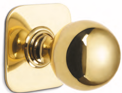
6406 Ball Centre Door Knob with Square Rose