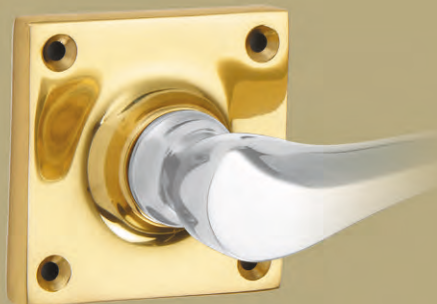
57mm Square Rose

* Suitable for use with multi-point locks