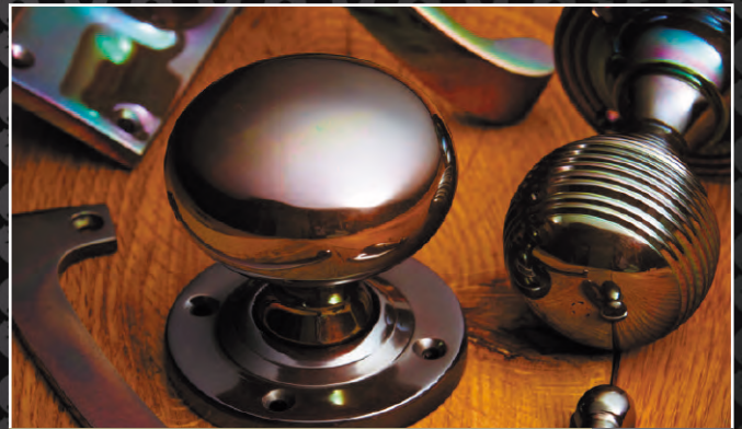
Real Bronze Metal Antique RBMA