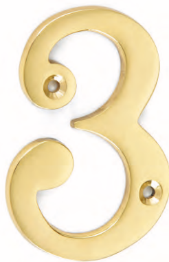
1769 76mm (3") Cast Numerals