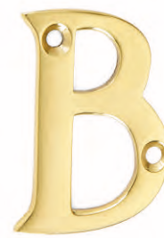
1764L 50mm (2") Cast Letters

Available in: 76mm (3") 100mm (4") 152mm (6") Available Pin Fix or Face Fix