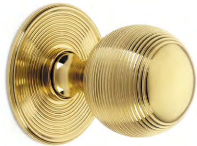
6407 Reeded Ball Centre Door Knob

Also available in Mortice or Rim Versions. See page 37