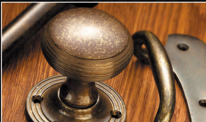
Marbled Brass *