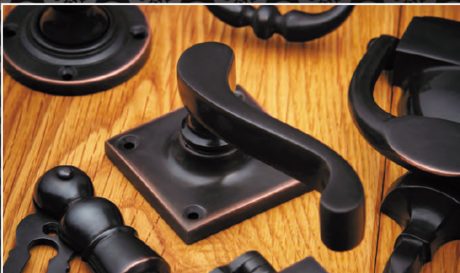
Oil Rubbed Bronze * ORB