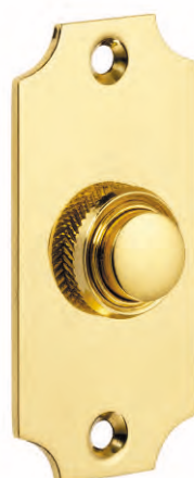
1917 Concaved Edge Bell Push

76 x 31mm Part of the Art Deco Suite . See page 93