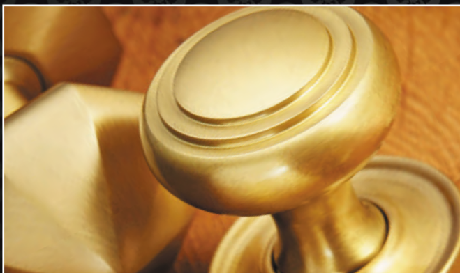
Satin Brass Unlacquered