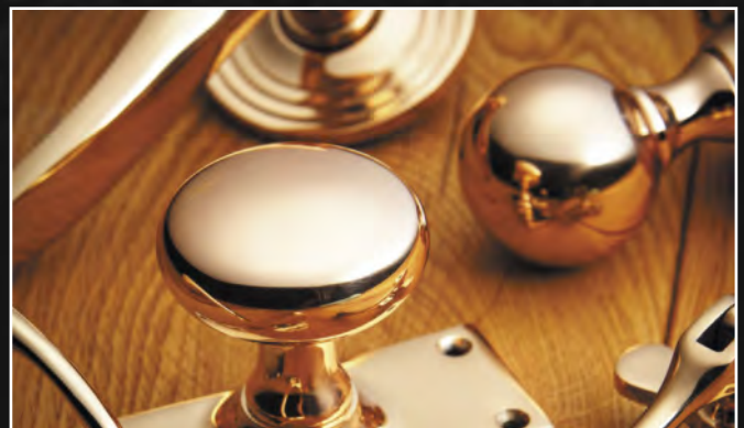
Polished Bronze Unlacquered