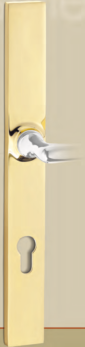
305 x 35mm *+ Euro Profile (shown)