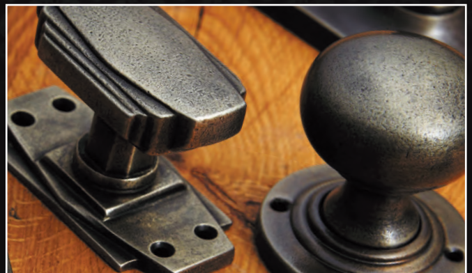
Distressed Antique Nickel * DAN