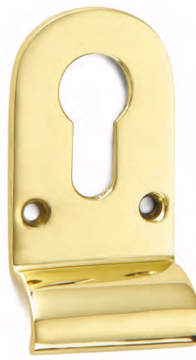
1774 Euro Profile Cylinder Pull