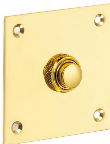
1911 Square Bell Push