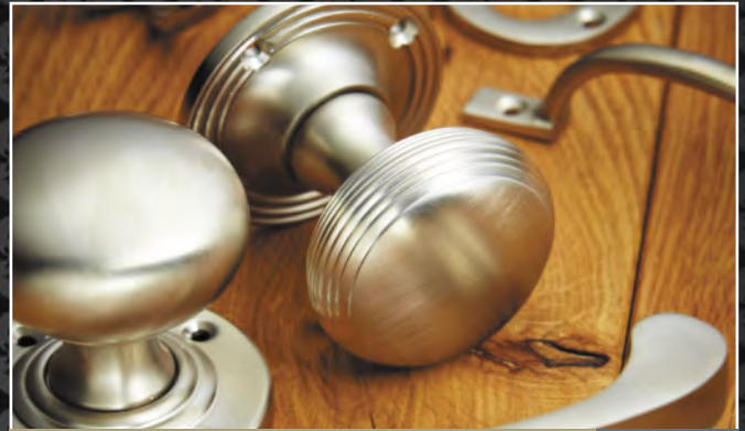
Satin Nickel Plate