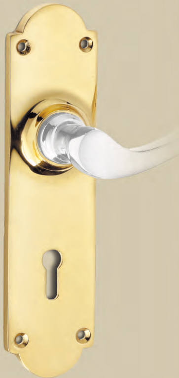
165 x 41mm Arched Lock (shown)