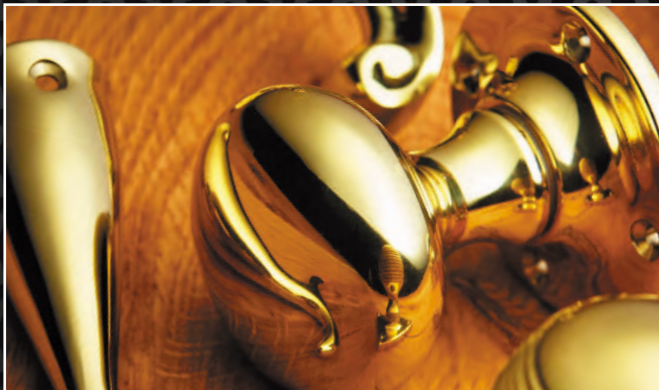
Polished Brass Unlacquered