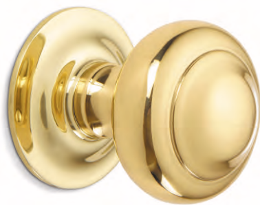
6344 Round Centre Door Knob