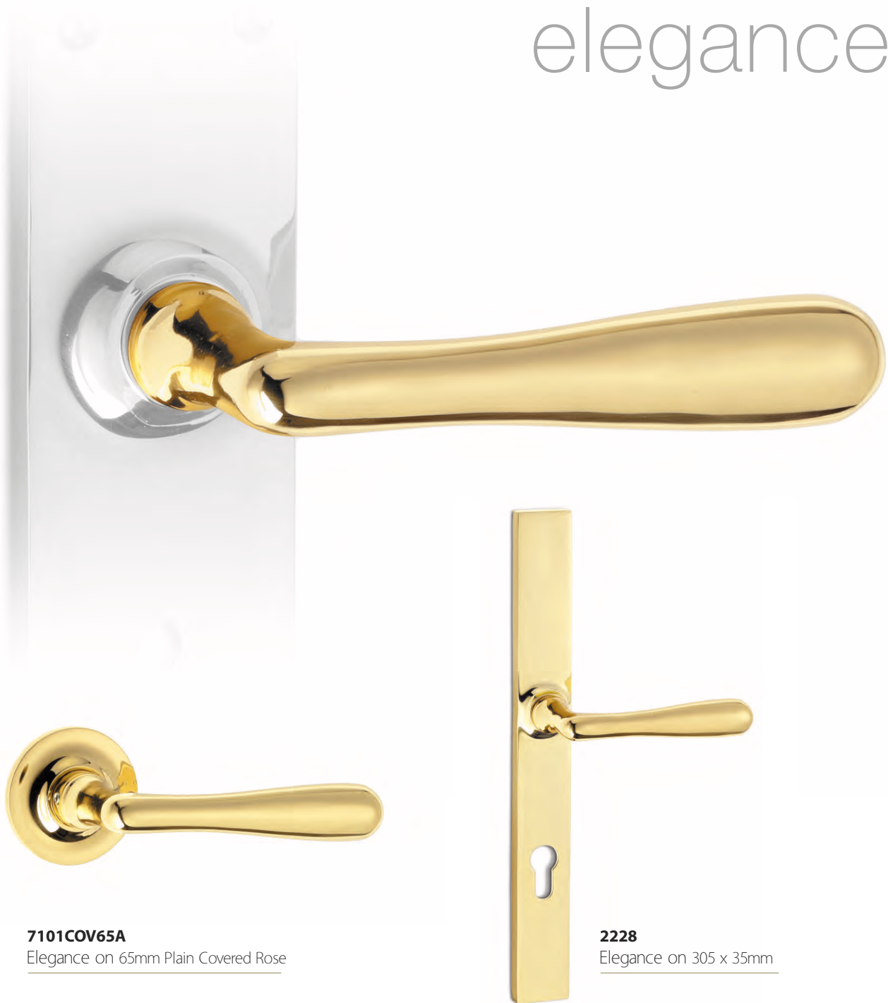
7101COV65A Elegance on 65mm Plain Covered Rose