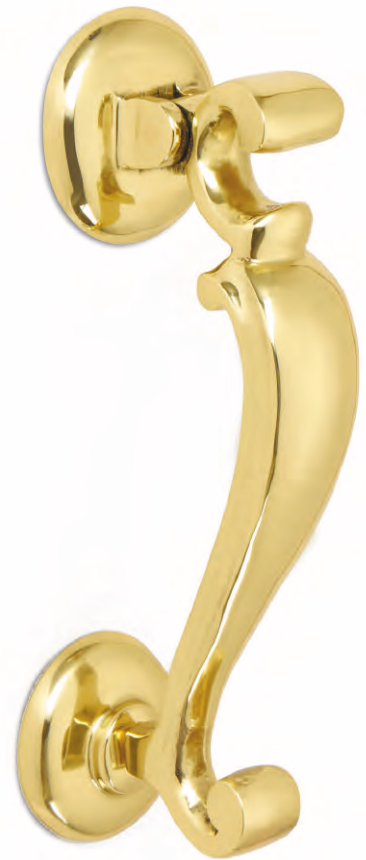
4120 Old Doctor's Knocker

Available as part of the Art Deco Suite , see page 93