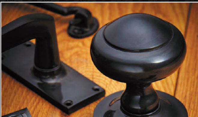
Dark Bronze Metal Antique * DBMA