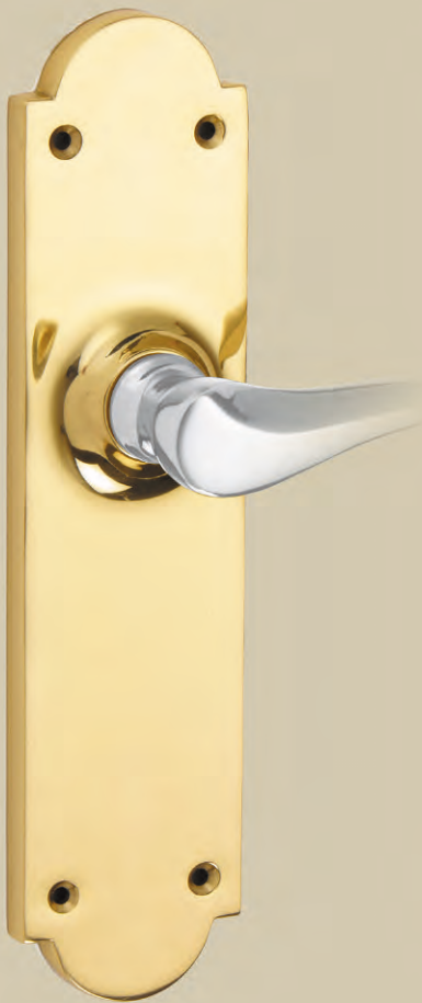
210 x 50mm Arched Latch (shown)