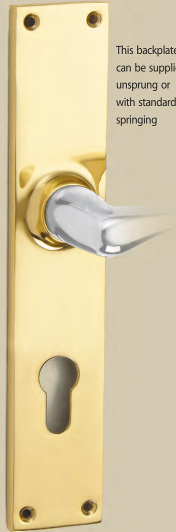
225 x 41mm * Euro Profile (shown)

This backplate can be supplied unsprung or with standard springing