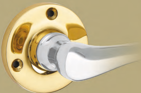
57/60mm dia Face Fixed 57mm for Lever Furniture 60mm for Knob Furniture