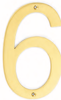
6420 Arial Font Numerals

Available in: 76mm (3") 100mm (4") 152mm (6") Available Pin Fix or Face Fix