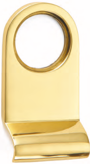
1763 Plain Cylinder Pull