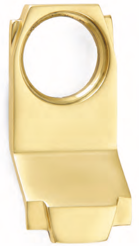
7016 Art Deco Cylinder Pull