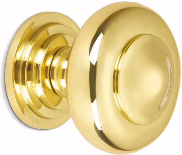
6345 4" Round Centre Door Knob on Stepped Rose

“achieve an elegant statement with our 4” designs”