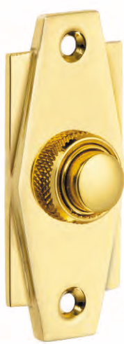
7015 Art Deco Bell Push

76 x 31mm Part of the Art Deco Suite . See page 93