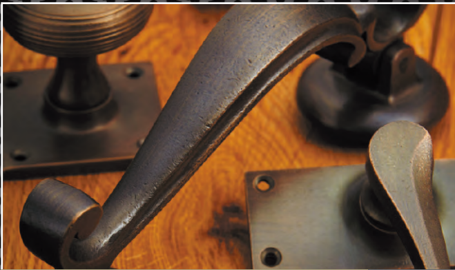
Tudor Bronze TB