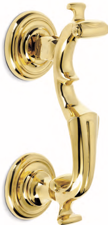
4140 London Door Knocker