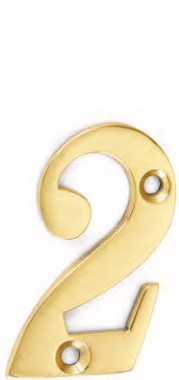
1764 50mm (2") Cast Numerals