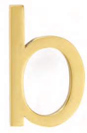
6421 50mm (2") Arial Font Letters

All upper case. Full alphabet available.