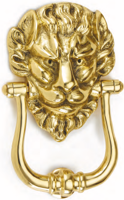
1768 Lion's Head Knocker