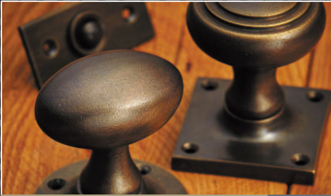
Distressed Antique Brass * DAB