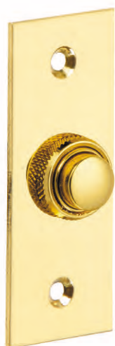
1910 Rectangular Bell Push