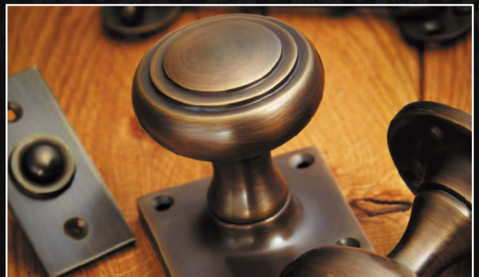
Antique Brass *