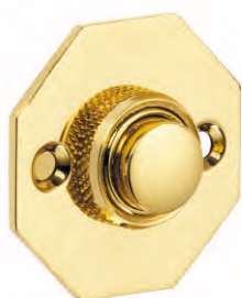
1916 Octagonal Bell Push