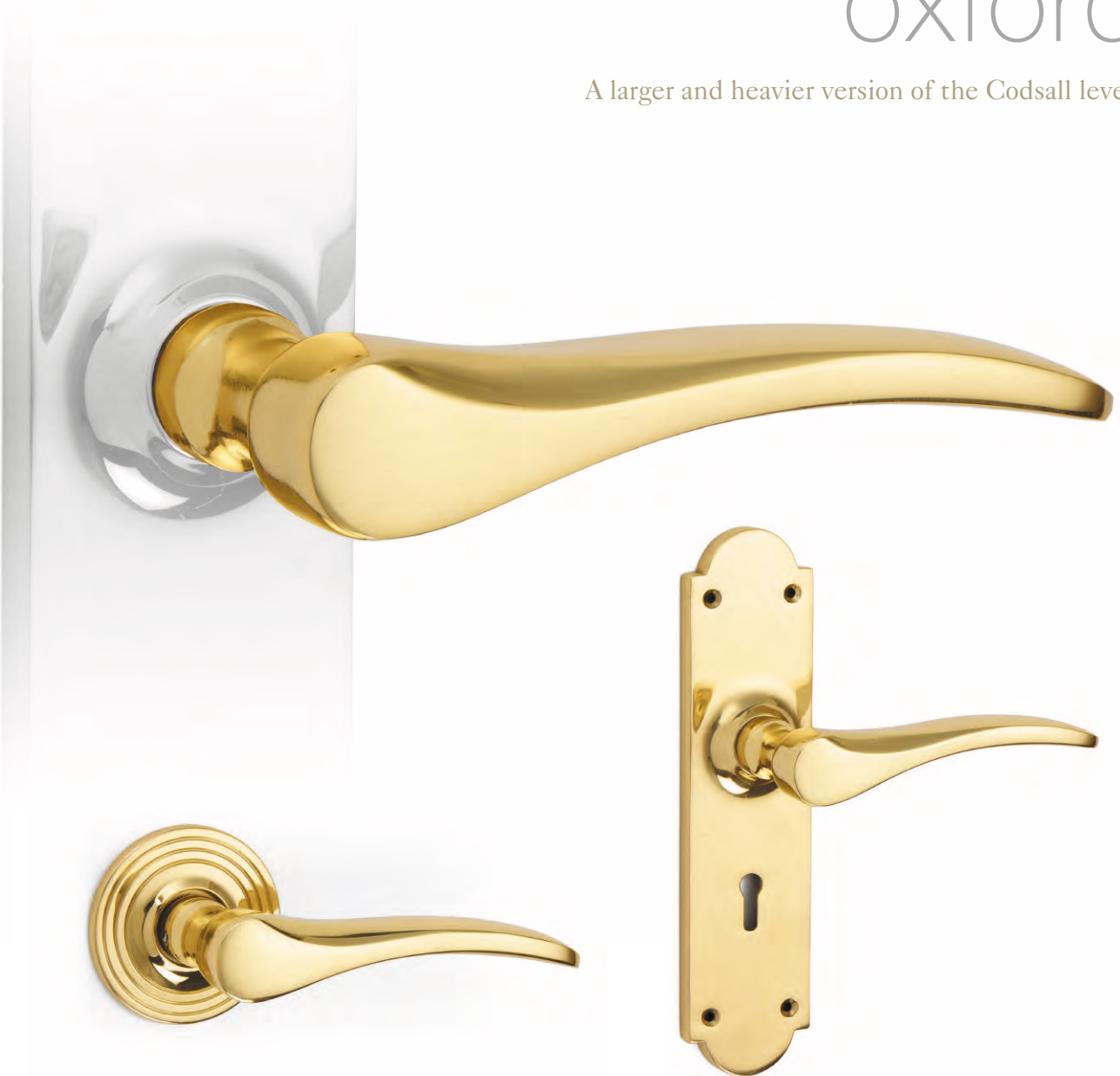
2051COV65C Oxford on Reeded Covered Rose

A larger and heavier version of the Codsall lever.