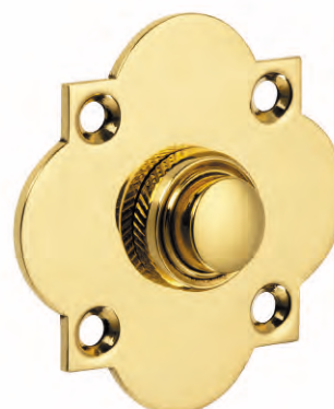
1915 Quartrefoil Bell Push